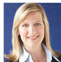
New Executive for HBO's Entertainment Division

Home | World | U.S. | N.Y. / Region | Business | Technology | Science | Health | Sports | Opinion | Arts | Style | Travel | Jobs | Real Estate | Automobiles | Back to Top