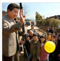
Out of Office and Into a Fishbowl in South Korea