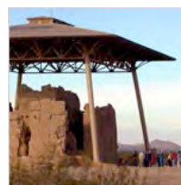
Timothy Egan: The Ghosts of Casa Grande